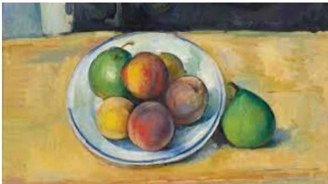
Paul Cezanne (1839-1906).

This week focus on the bounty of the harvest season and on round things again. I am looking at apples, but you can work with whatever you are harvesting or are finding in your neighborhood or at the market. Squash, eggplant, apples, pears, nectarines, strawberries or flowers.